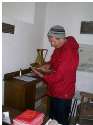
At the June working party (above) and the improvised cruet set (left).