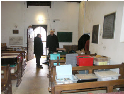
Clearing the church for re-roofing (below).