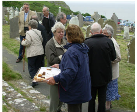
Top row: standing room only at the service. 2nd row: refreshments after the service. Thanks to Iris for at least half of the photos of the service.