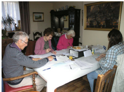
Preparing the sponsor forms for binding (left) and the finished articles (below).