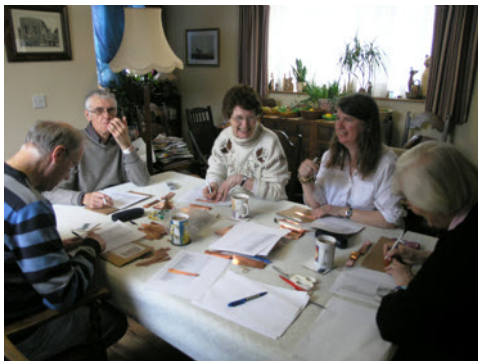
Embossing the labels (above).

The next stage will be to prepare the sponsor forms for binding and to mark the forms with the slate numbers. Invitations to the slate blessing service will also be prepared. A working party for this has been planned for the morning of Monday 16 April. Please contact the Secretary if you would like to take part.