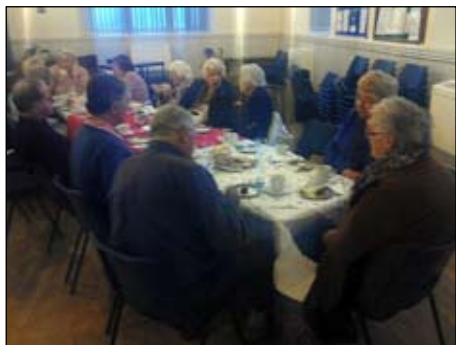
Photos taken during Parish Fellowship Christmas Party.