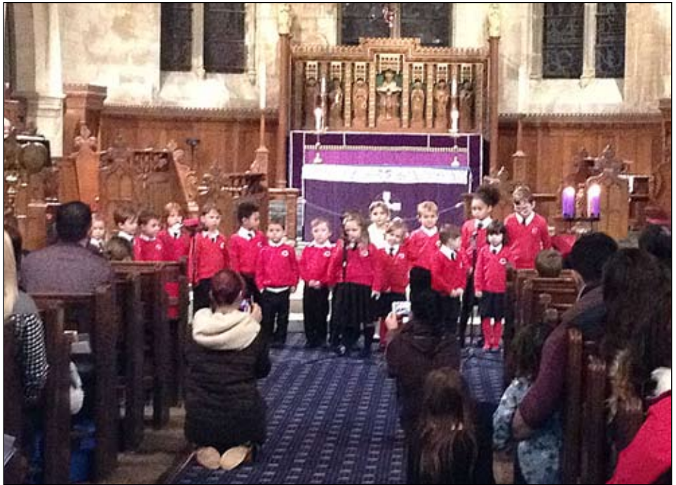
Christingle Service, 6 December.