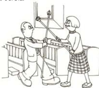
In a tradition dating back to 1977, the churchwardens re-enacted "Star Wars"

In Europe, Christian Aid's partners in the ACT Alliance, a global coalition of more than 130 churches and church-related organisations that work together in humanitarian assistance, are providing emergency relief in Greece and Serbia.