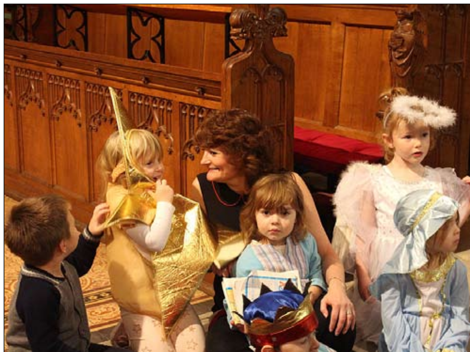
Crib Service, 7 December.