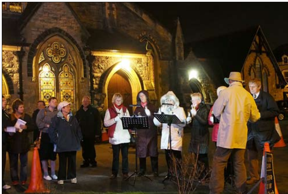
Carols around the Christmas Tree, 18 December.