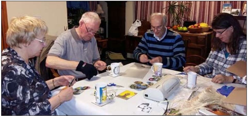
Preparing the Friends of St. Tudno's Christmas tree.

If you are interested in learning more about the Friends of St. Tudno's, do get in touch with me.