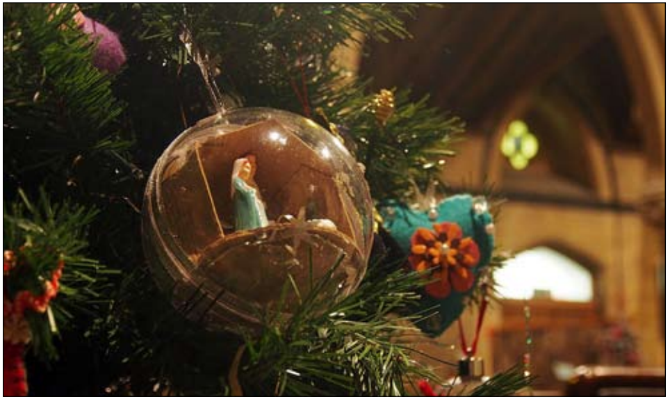
Christmas Tree Festival, 18-22 December.