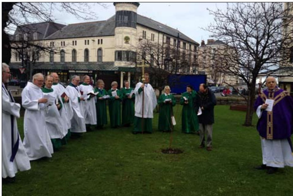
Blessing of new tree – Holy Trinity Churchyard, 6 December.